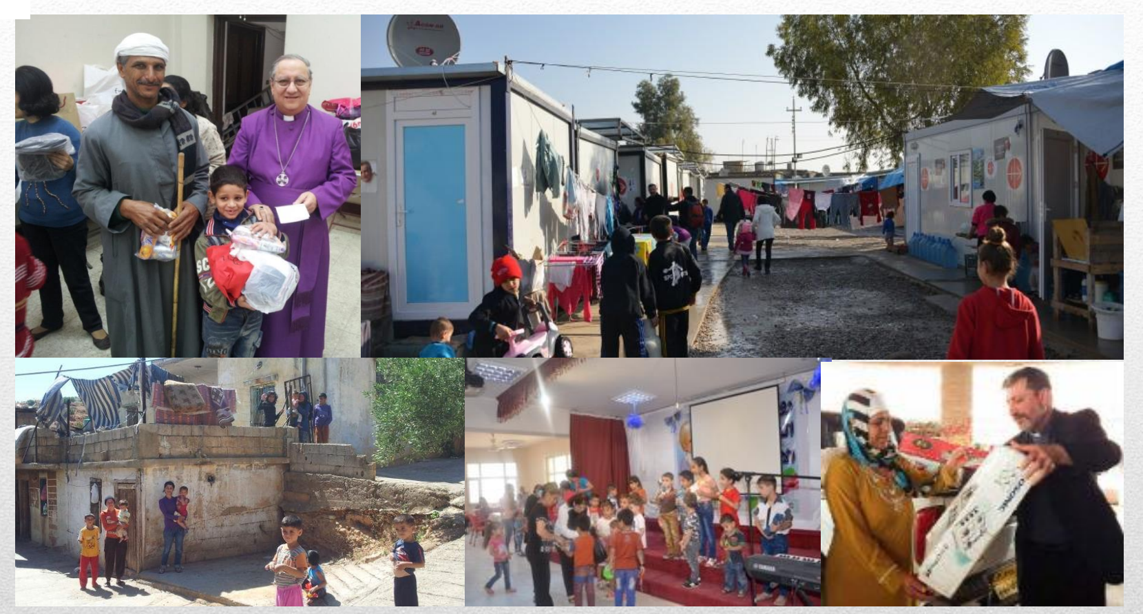
Providing support for all refugees and internally displaced people who come them.

RefugeeEgypt, Cairo Egypt Internally displaced Christians, Baghdad & Erbil Iraq Syrian refugees in Amman, Jordan