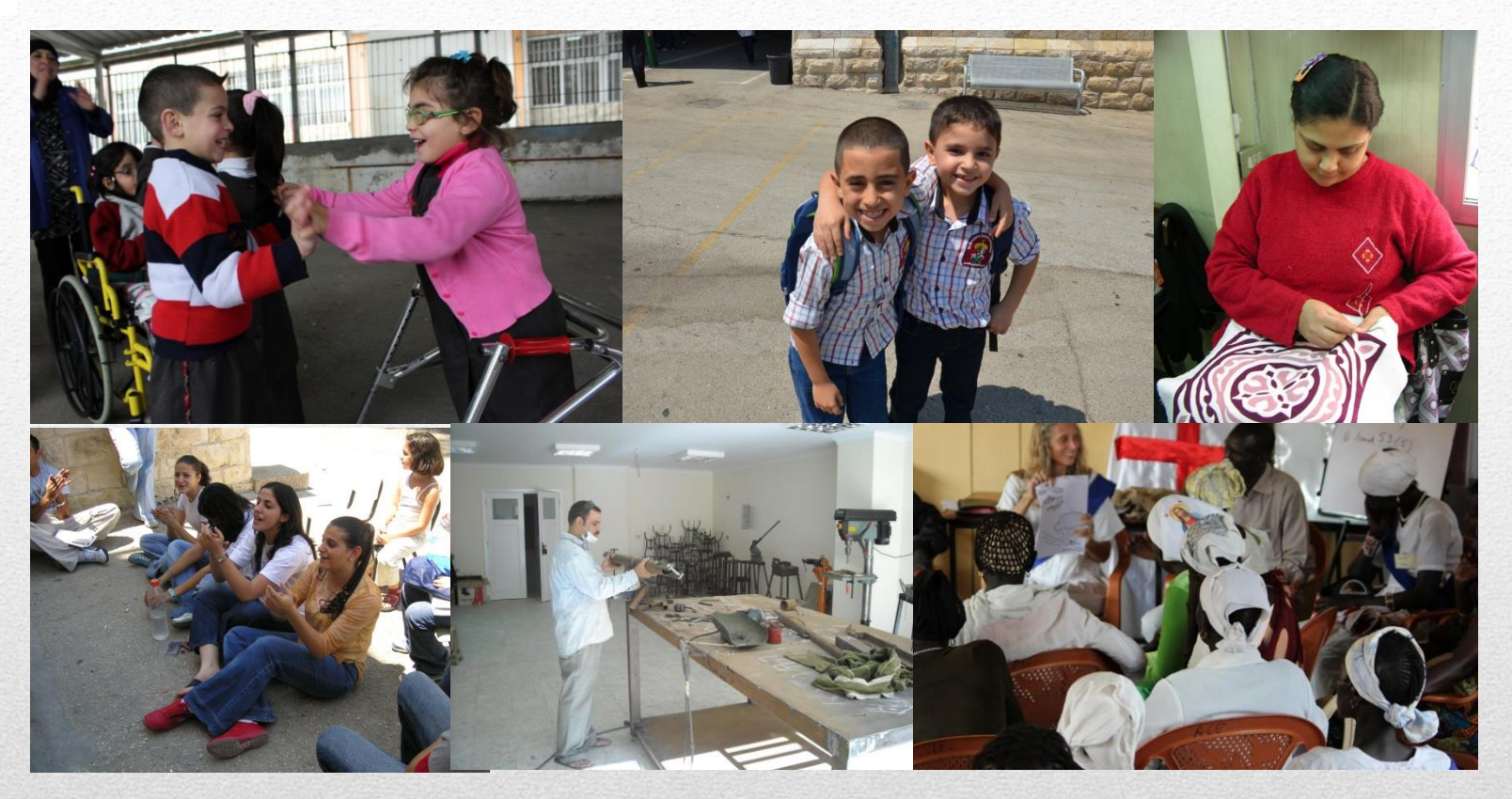
Providing training and education for all.

Princess Basma Centre for Disabled Children, Jerusalem St George's School and St George's College, Jerusalem Vocational Centre for deaf adults, Cairo, Egypt Mother's Union training sessions, Gambella