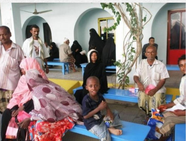
Providing primary and preventative medical services to meet the needs of the community.

Al Ahli Arab Hospital, Gaza and St Luke's, Nablus Harpur Hospital, Menouf and in Sadat City, Egypt Ras Morbat Clinic, Aden, Yemen, & St George's Church, Baghdad